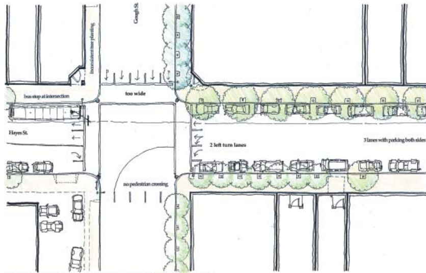
HAYES ST. at GOUGH ST. INTERSECTION: EXISTING CONDITIONS