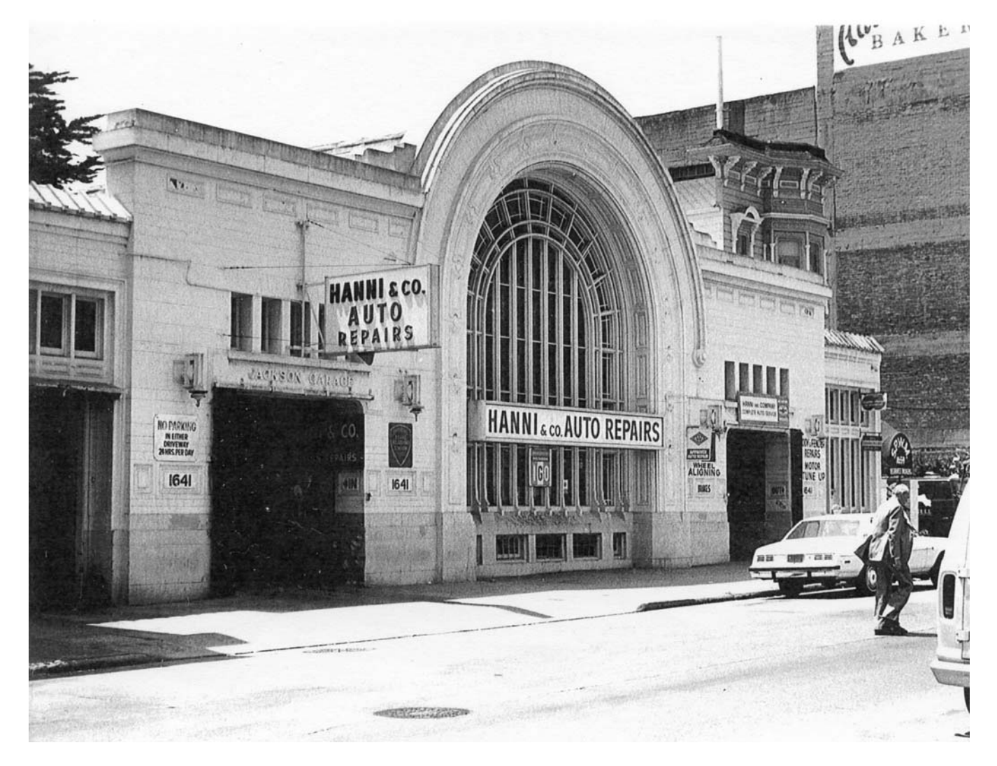
Photo from the department of City Planning's Van Ness Avenue Plan, 1980s

The character defining features of this building are its height and width, the scored stucco surface, the wooden mullions and muntins of the monumental arched window, the wooden mullions in the windows of the far western wing, the small wooden windows over the entrances, the ornamental details including all moldings, the cornice, the slanted leading edge of the roofs of the east and west wings, and the small windows in the bulkhead.