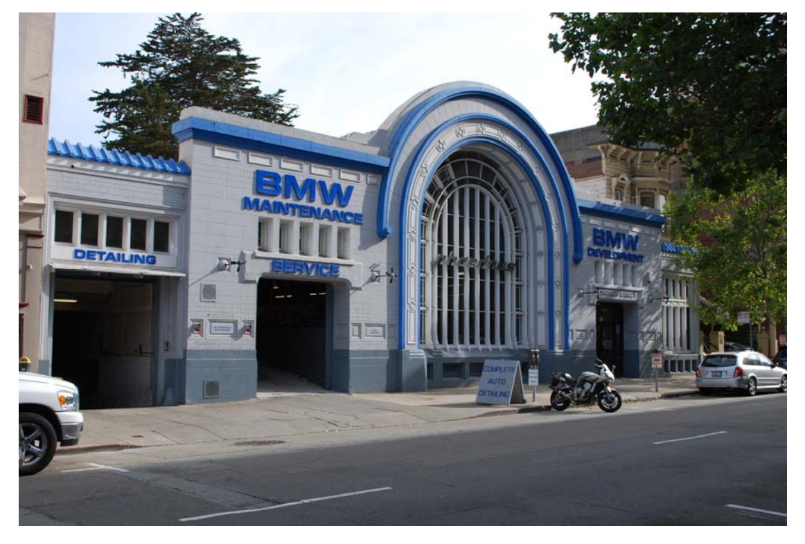
Perspective view, looking southwest

The entire composition rests upon a low bulkhead punctuated by vehicle entrances and small windows.